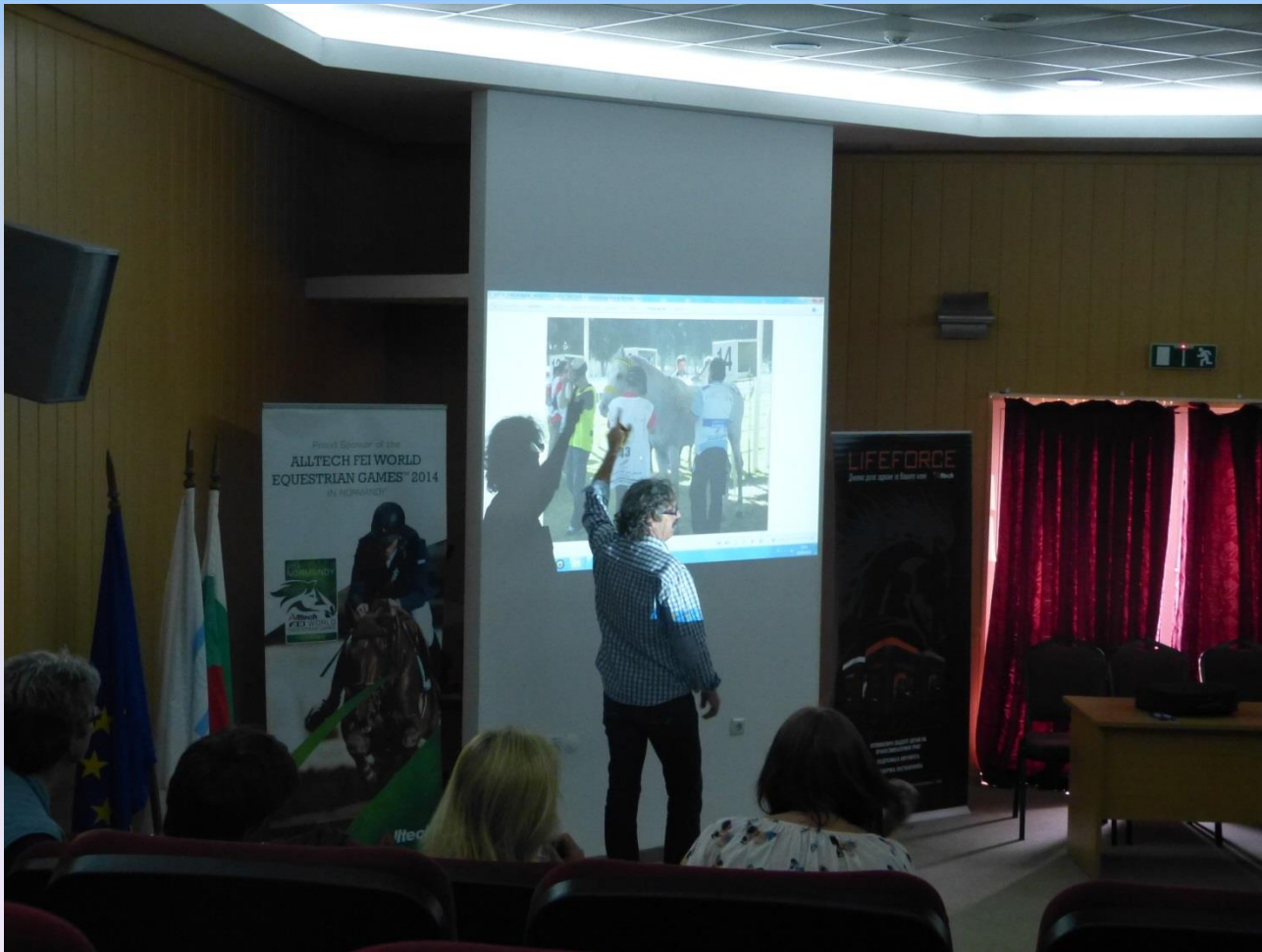
Endurance Seminar in Hisar(BUL) (April 2014)