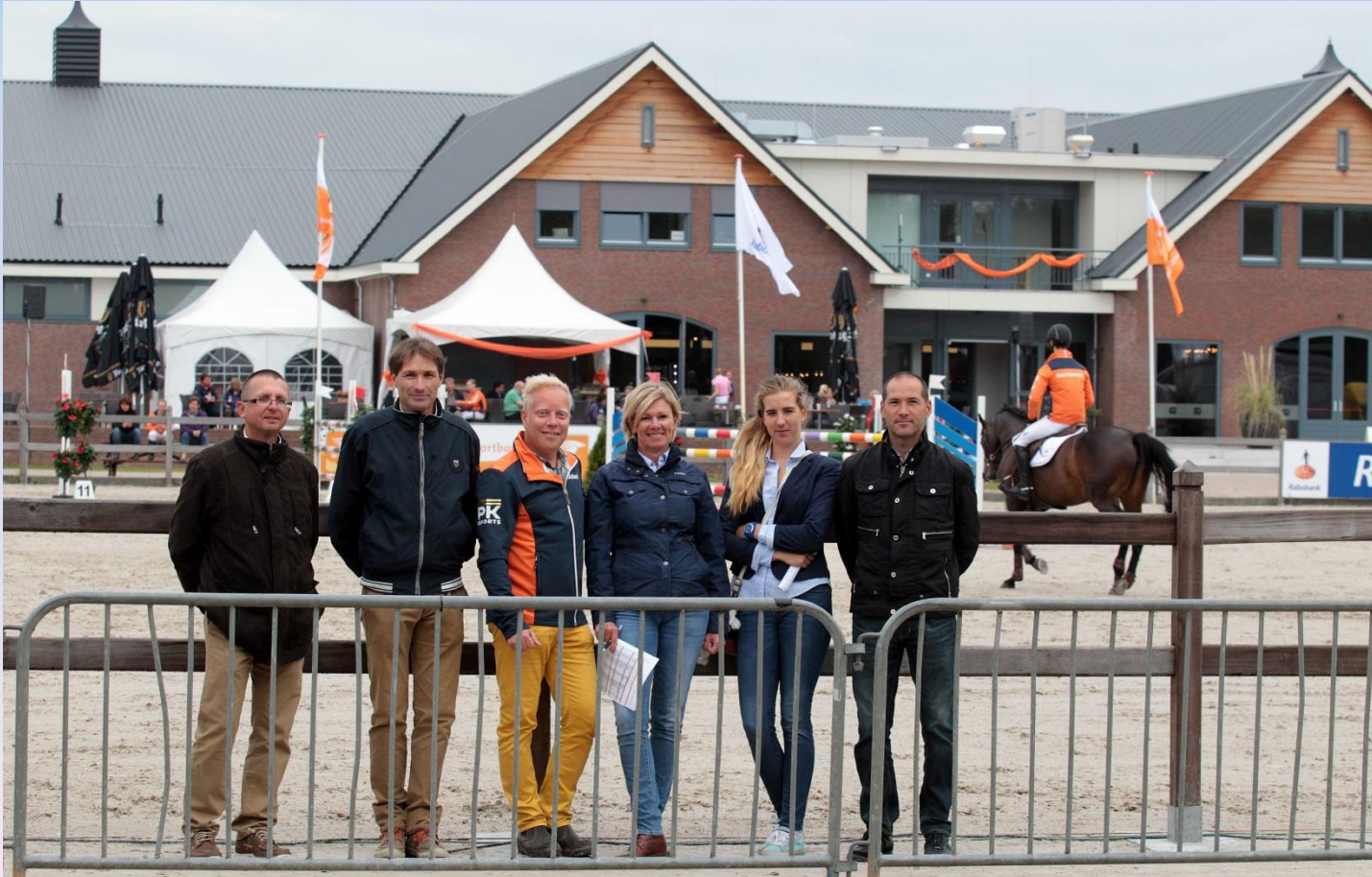
National Talent Day in Ermelo September 2014