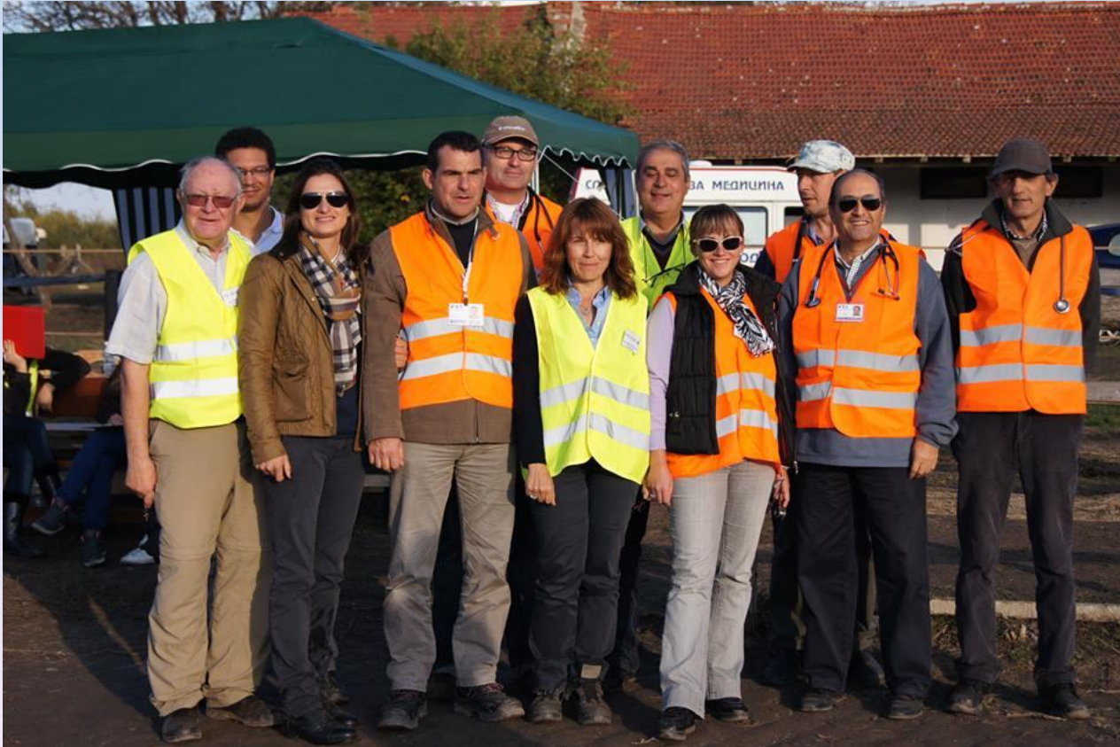
Ruse(BUL) (October 2013)